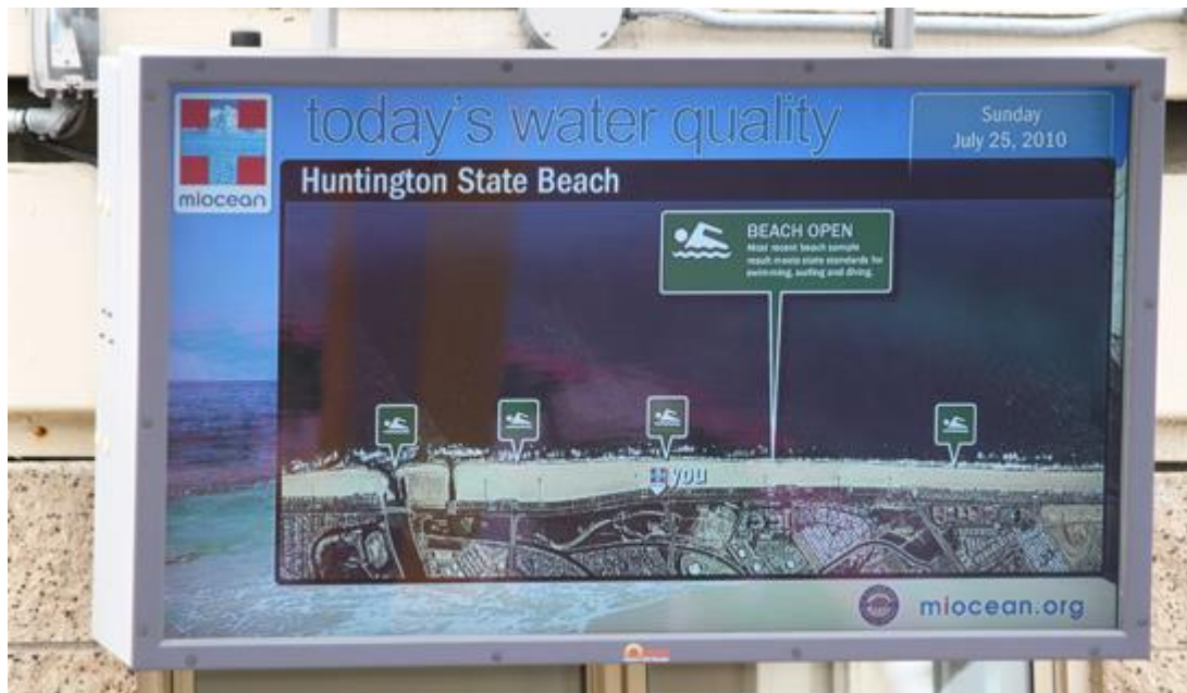
Figure 4.3-2. Electronic sign at Huntington State Beach providing near real-time water quality information to beachgoers.

One outstanding technical question about qPCR is how it will perform across the different beach types found in Southern California. To date, studies have been conducted at only a handful of beaches across the region, and there is not enough data to help predict if the method will perform as expected at any given beach type (embayment, open coast, etc.). For example, one of the important technical issues surrounding the qPCR method is termed 'inhibition'. Inhibition occurs when constituents such as humic or fulvic acids found in environmental water samples interfere with the chemistry of the PCR reaction, which can lead to underestimation of the target. However, it is unclear if this occurs more often at a particular type of beach. To help answer this question, the Microbiology Group from the Bight '13 Regional Monitoring Study organized by SCCWRP is collecting water samples at a variety of beach types from Ventura to San Diego. SCCWRP has trained these agencies in conducting qPCR, and the results are expected to shed light on the performance of the qPCR method across the different beach types in the region. When the current impediments to adoption ease, agencies will already have information about where they are likely to be most successful employing the method.